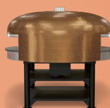
PASS-THRU (Due Bocche Oven)