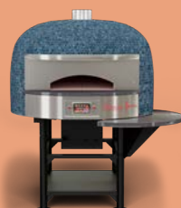
the ELECTRIC (Neapolitan Design)