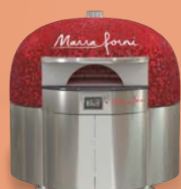
the ROTATOR (High Production)