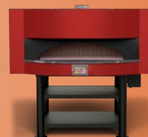
MS SERIES (Space Efficiency)