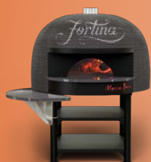
the NEAPOLITAN (Wood-Fired Cooking)

Marra Forni has many test kitchens located throughout North America, Canada, the Middle East, and Latin America. You can take your next authentic Italian wood, gas, or electric brick oven for a test drive anytime.